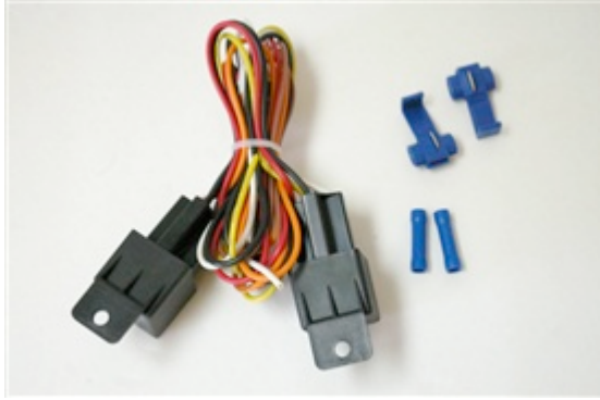
Positive Ground Relay System