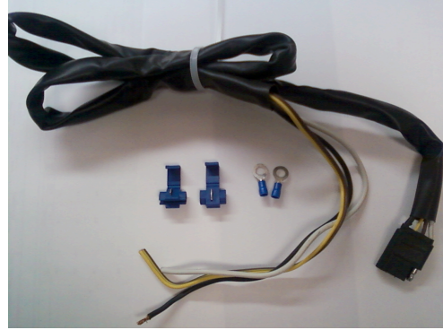
4 Pole Wiring Harness Kit (comes with Trailer)