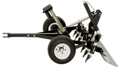
(Gravel Rascal, Arena Rascal Pro and Infield Rascal)